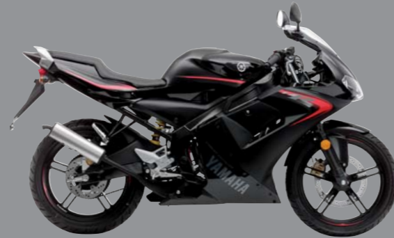
BL3 (Midnight Black)