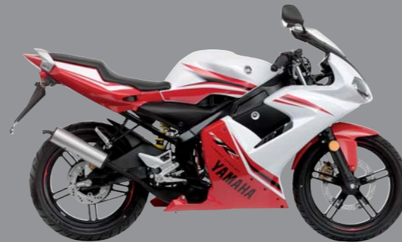
PWS1 (Sports White)

Always wear a helmet, eye protection and protective clothing. Yamaha encourage you to ride safely and respect fellow riders and the environment. Specifications and appearance of Yamaha products shown here may vary according to requirements and conditions, and are subject to change without notice. For further details, please consult your Yamaha dealer.